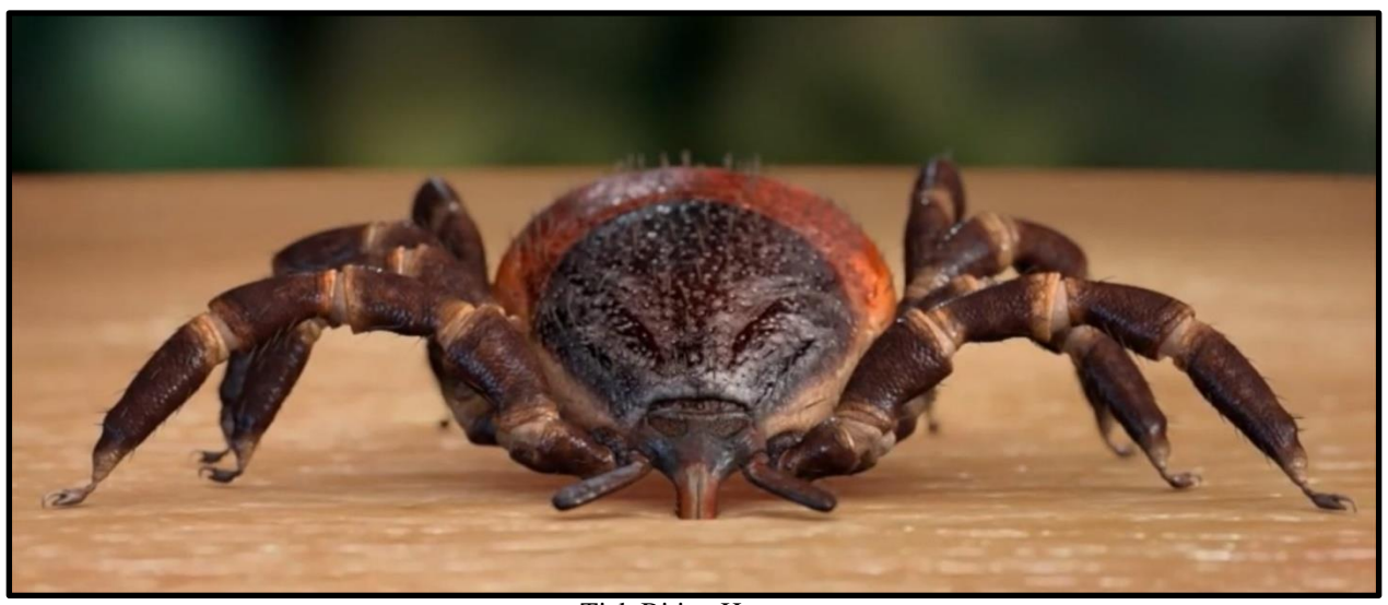
Tick Biting Human

Nymphal ticks are the primary source for transmitting tick borne diseases to humans as they are rarely noticed because of their size: less than 2 mm (about the size of a poppy seed). Adult ticks are approximately the size of a sesame seed.